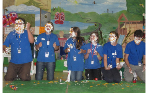
"Leaders" challenge at "WasteWatchers" Summer Holiday Club, Storrington First School, August 2009

We continue to receive significant support in prayer and finances from individuals, as well as practical help from those who come and volunteer to help with assemblies, lunch clubs, after-school clubs and holiday clubs.